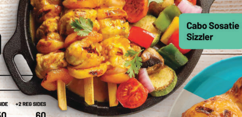
Cabo Sosatie Sizzler