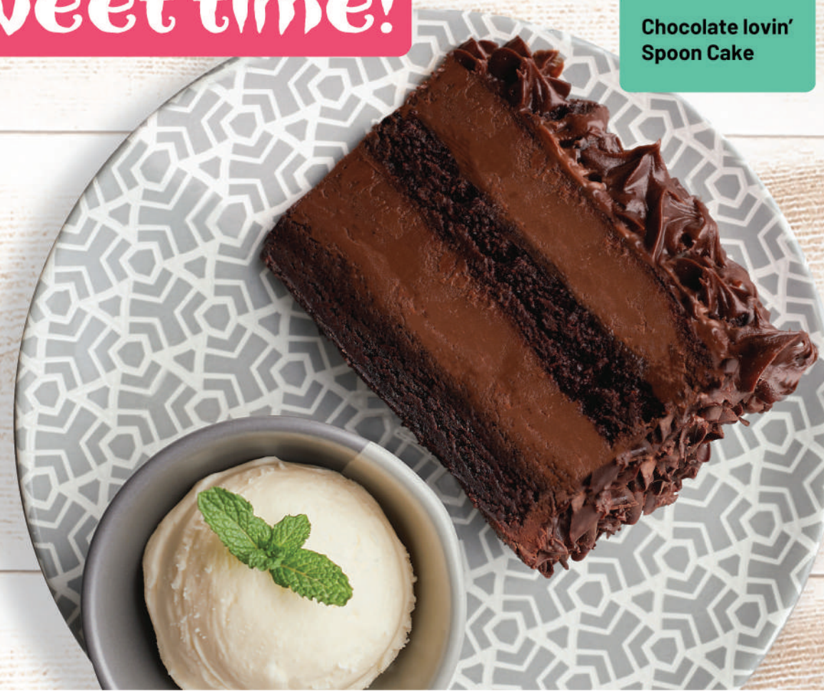
Chocolate lovin' Spoon Cake