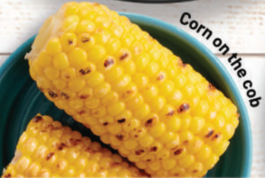
Corn on the cob