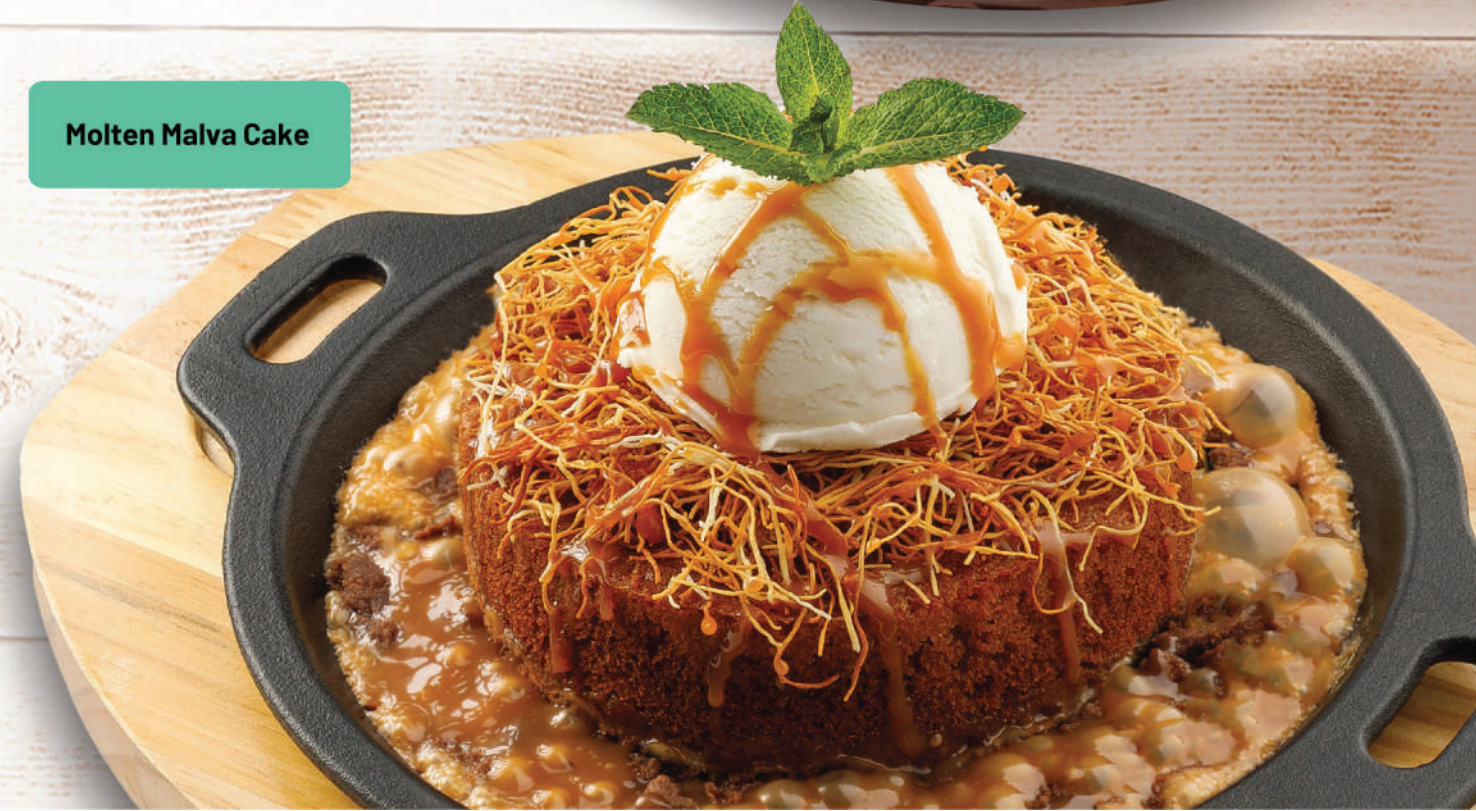
Molten Malva Cake