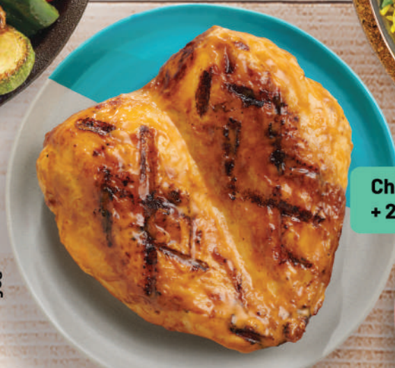
Chicken Butterfly + 2 Regular sides