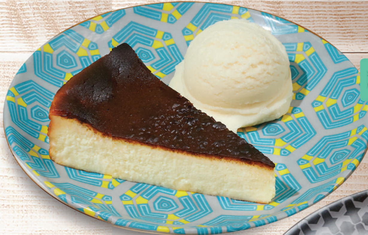
NEW San Sebastian Cheesecake