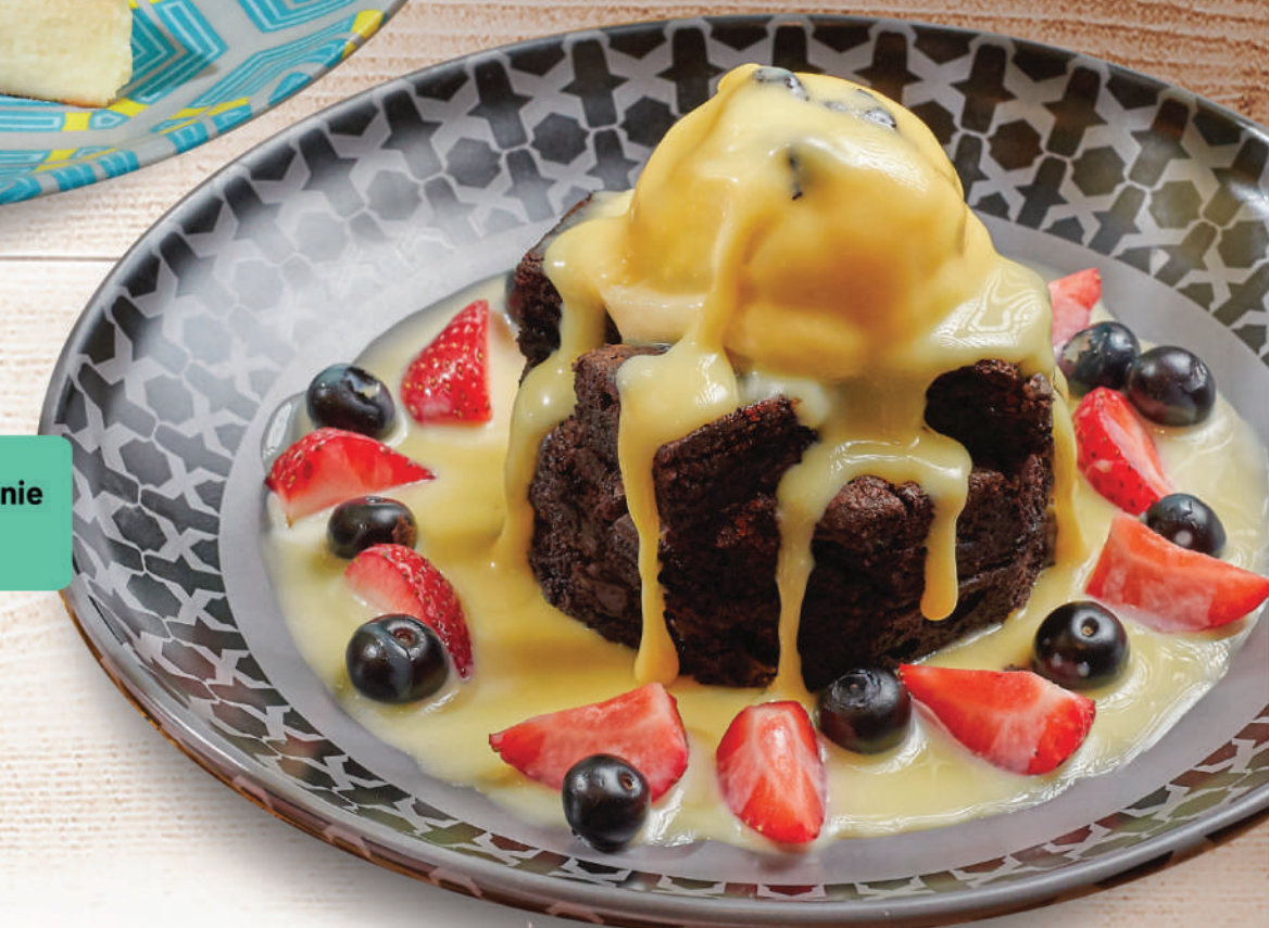
NEW Chocolate Brownie Lava Cake