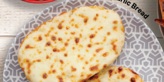
Cheesy Garlic Bread